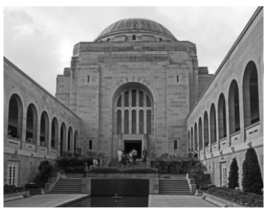
May 2024 Raw Image Challenge Accepted Brenton Elsey